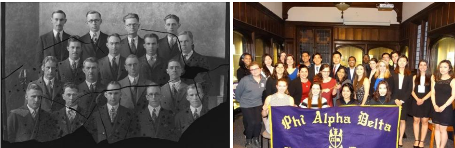
Charter Members of Gunter Chapter at Univ. of Colorado 1928 Charter Members of University of Chicago Prelaw Chapter 2017