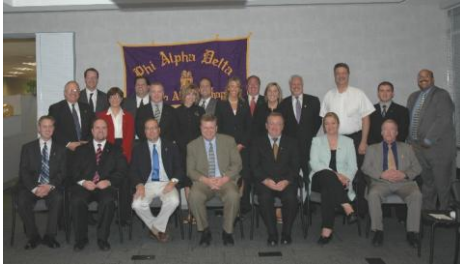
Installation of the West Suburban Alumni Chapter 2006