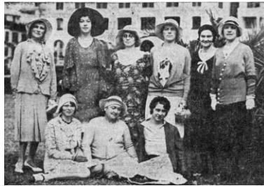
Installation of Alpha Phi Chapter (P.D.D.) at Univ. of Miami 1931

These questions should be used if the interviewee was involved in the chartering or reactivation of their chapter.