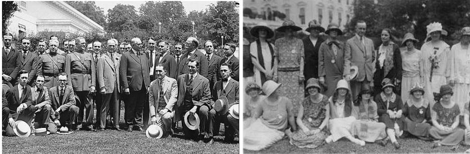
Phi Alpha Delta initiating President Harding (1922) and Phi Delta Delta visiting President Coolidge at the White House (1924)

Phi Alpha Delta's history goes back over 120 years, and unfortunately much of that history has been lost. Records have been lost or destroyed, and many of our members and prior historians have either passed out of contact or passed away. In October 2022, the Fraternity appointed its first Chief History Advisor/International Historian and appointed a P.A.D. History Committee to work with the International Historian to recover, preserve, and share Phi Alpha Delta History.